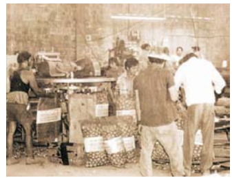
Packing onions for export orders in the early 1970's.