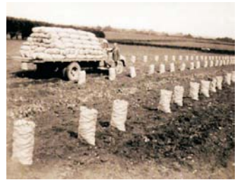
Potatoes being harvested and bagged by hand in the 1940's.

They manage a production base of 2500 acres, 120 permanent staff and a group of specialised companies constituting the Wilcox group.