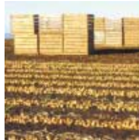
Sustainable supplies are possible from 2500 acres of croplable land across 4 regions.

Large growing and packing capacity, and keen marketing skills means buyer contracts can be negotiated and met with a guarantee of sustainable supply.