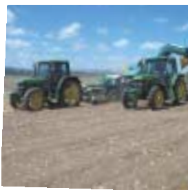
Modern machinery makes for efficient harvesting.

Automated machinery is employed by skilled operators in the fields to ensure produce reaches the packhouses in prime condition.