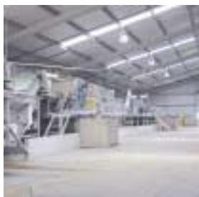
Packhouses are ergonomically set up to handle large volumes.

Packhouses are equipped with efficient cleaning, grading and packing equipment enabling orders to be processed on time.